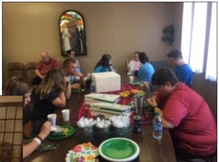
St. Paul's hosted a Youth Mission Team from Sweetwater, Texas this past weekend, feeding them and putting them up for the night at the church, on their way home from California.